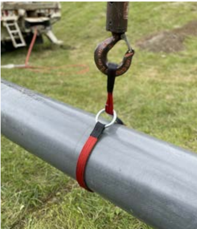
FIG. 9.1. Rubber belt grip sling

Nylon straps or rubber belt grip slings, such as those supplied by MacLean Power, are recommended for lifting the poles. The straps should be looped around the pole, and one end is inserted through a loop on the other end in a choke, as shown in Figure 9.1. Metal chains or straps should not be used, as they may damage the surface of the poles.