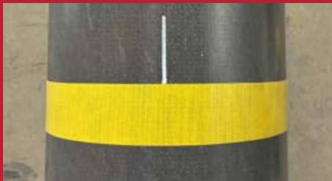
FIG. 7.1. Groundline marking - yellow tape

Each pole is marked at its mid-length with a white or silver line as shown in Figure 7.2. When there is no attachment, this marking coincides with the center of gravity of the pole.