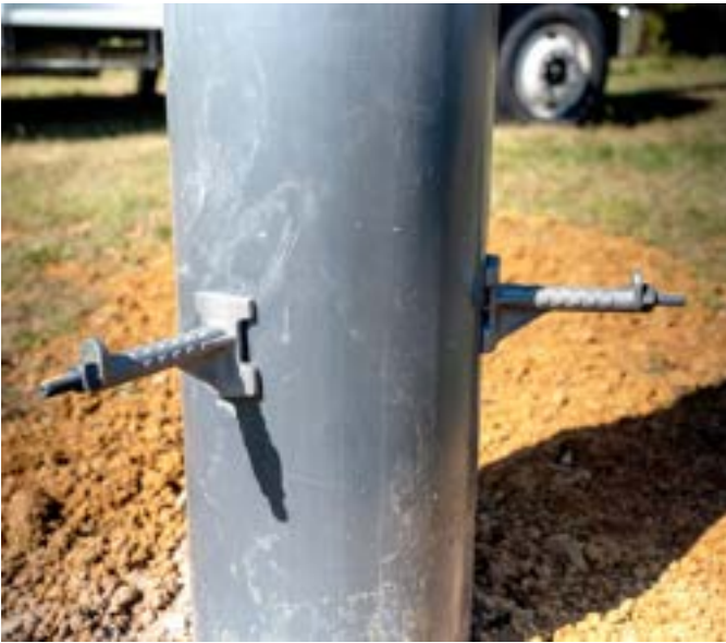
FIG. 8.1. Pole step