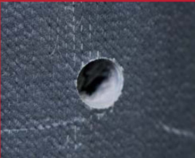
FIG. 10.1. Hole example