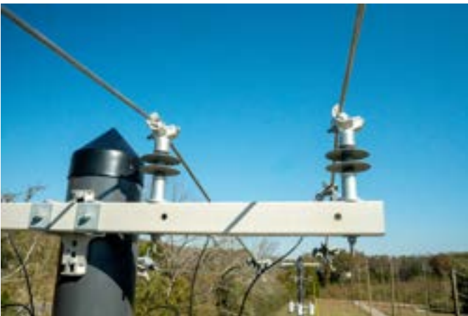
FIG. 8.2. Crossarm connection