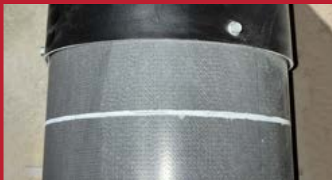
FIG. 7.3. Top of pole markings