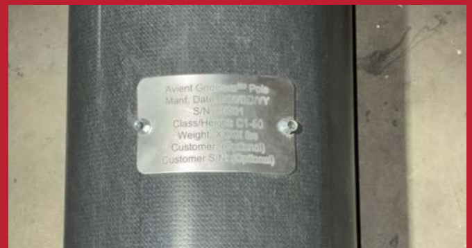
FIG. 7.4. Name plate