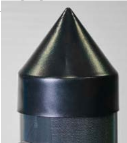
FIG. 8.5. Cap