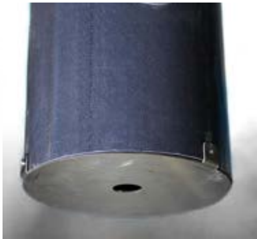
FIG. 8.6. Base Plate