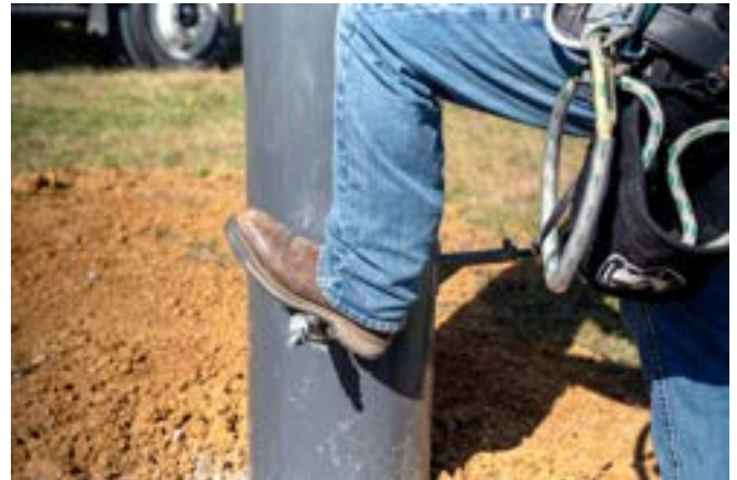
FIG. 8.3. Pole step test