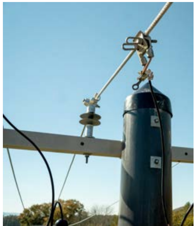
FIG. 8.4. Crossarm connection with other distribution products