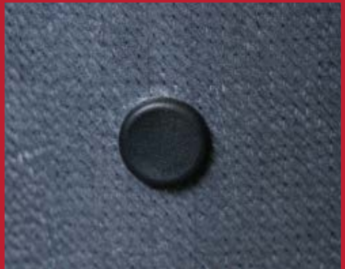
FIG. 10.2. Hole plug installed