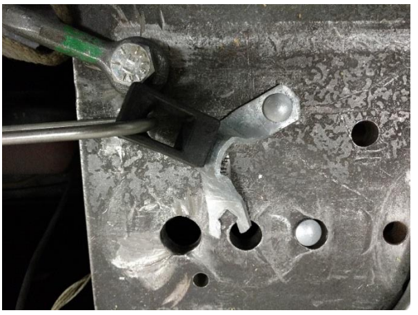
Sample after Cantilever Test