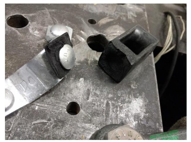
Sample after Cantilever Test