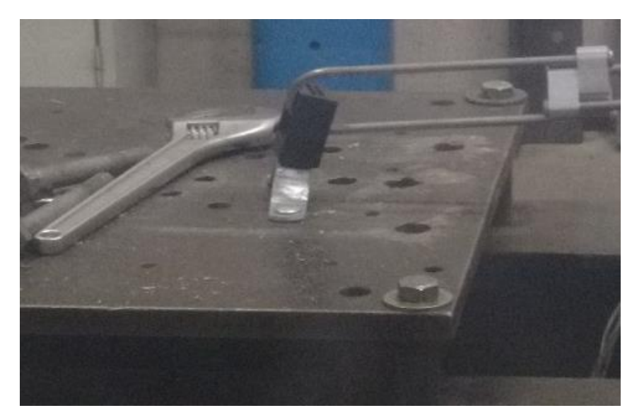
Figure 2: Cantilever Test Setup