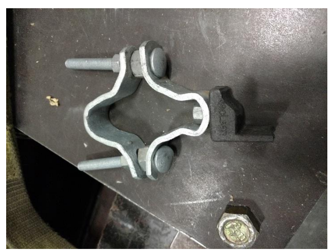
Samples after Tensile Test