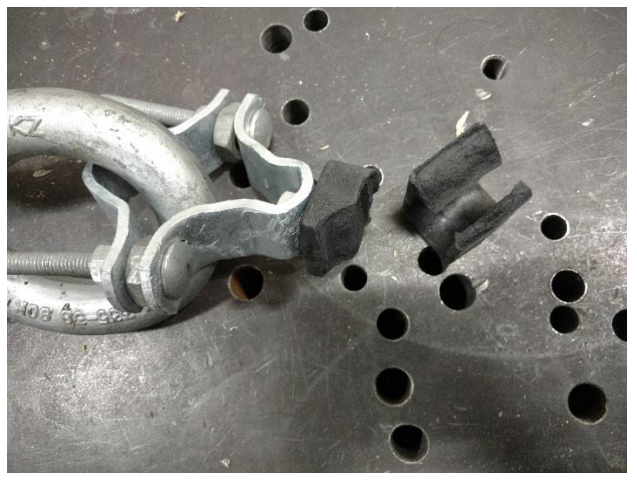
Sample after Tensile Test