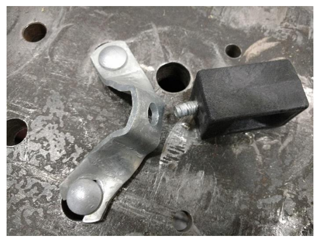
Sample after Cantilever Test