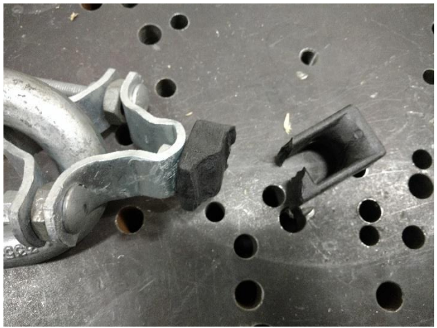
Samples after Tensile Test